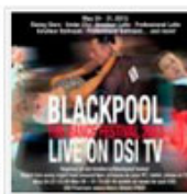
BLACKPOOL DANCE FESTIVAL 2013 Live on DSI ...