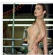
Dancer in Tan Satin, Buffalo Sole shoe for ...